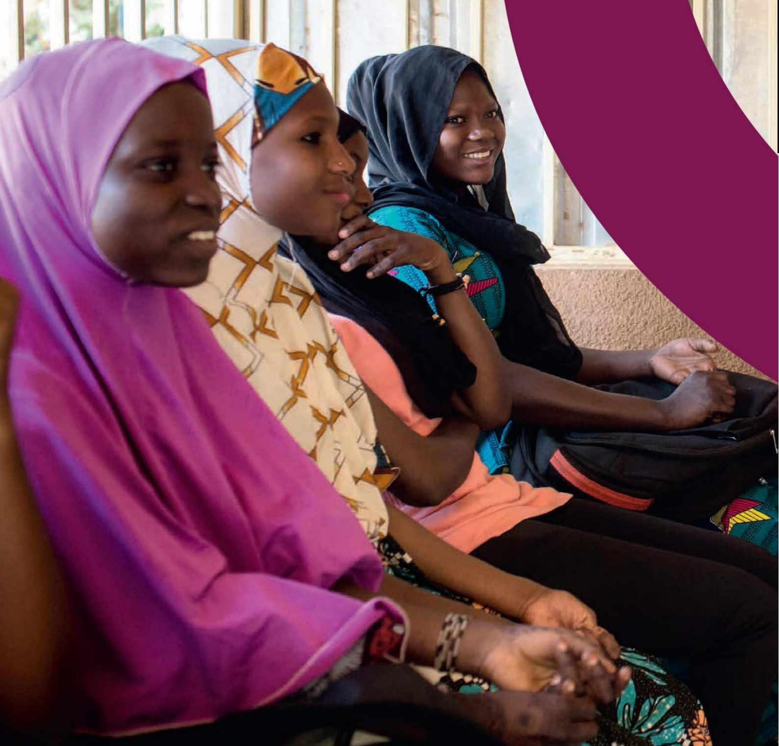
Photo caption: Niamey - JADES project for the promotion of sexual and reproductive health of young people and adolescents in Niger: awareness raising activity on sexual and reproductive health